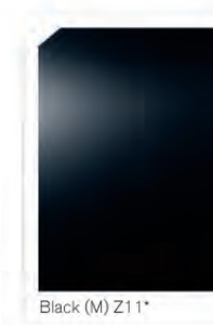
Black (M) Z11*