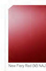
New Fiery Red (M) NAJ*