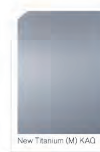
New Titanium (M) KAQ