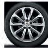
2.0l ACENTA 18" Alloy