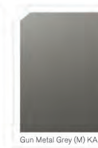
Gun Metal Grey (M) KAD