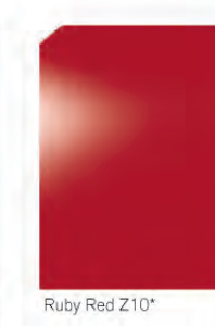
Ruby Red Z10*