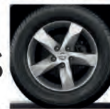
1.6l ACENTA 16" Alloy