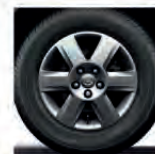
1.6l VISIA 16" Wheel cover