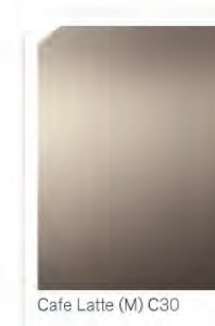
Cafe Latte (M) C30