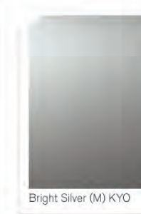
Bright Silver (M) KYO